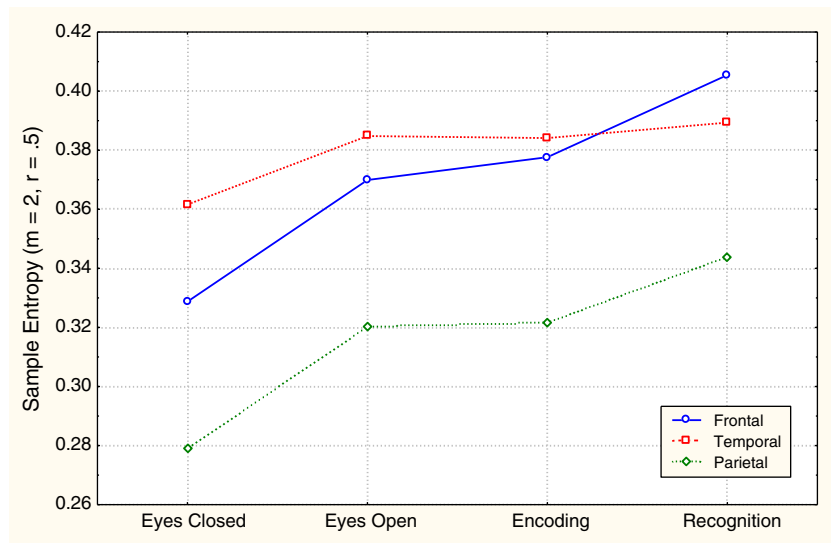
Fig. 2 – Entropy across four experimental phases in the frontal, temporal, and parietal lobes averaged across all participants.

lower for the poorer-performing older group. Gutchess et al. (2007) compared young and old participants' abilities to recall a scene from memory, finding that recognition levels were unaffected by age, but that the older groups showed lower ERP activations in frontal and parietal areas. Interestingly, this latter finding suggests that, even in the context of similar levels of behavioural performance, patterns of brain activity may help clinicians to distinguish normal older adults from older adults at risk of cognitive decline. Notably, in terms of the comparison between older controls and older declined adults, these findings of Gutchess et al. (2007) are analogous in certain respects to our findings. In the current study, older controls and older declined adults did not differ significantly on the experimental word memory task, and while this precluded an examination of the relationship between group differences in entropy and group differences in performance, the trend toward reduced frontal and parietal entropy in older declined adults suggests that there were some subtle brain state differences between the two older adult groups.